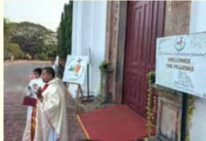
A Divine Moment on Cathedral Day: Parish priest leads the prayer before opening the Jubilee Door.

The day began with morning prayer, “Povitir Sobhechem Magnnem” followed by Eucharistic celebration. The Blessed Sacrament was exposed from 7.30 am to 6 pm and the day way spent in adoration.